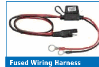
Fused Wiring Harness

Optional mounting wings for permanent installation