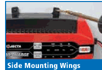
Side Mounting Wings

Revitalises tired batteries, increasing battery life and performance*